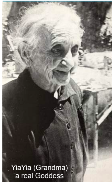
YiaYia (Grandma) a real Goddess

Women of Nebraska specializes in small group tours. The price of this tour is based on a minimum of 20 travelers. Should we, for any reason, only reach 15-19 travelers, we will offer the exact same tour with a supplement of $200 per person. We will also offer a refund of all funds paid to Executive Travel 90 days prior to departure, should the tour not be materialized.