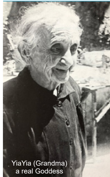
YiaYia (Grandma) a real Goddess

Women of Nebraska specializes in small group tours. The price of this tour is based on a minimum of 20 travelers. Should we, for any reason, only reach 15-19 travelers, we will offer the exact same tour with a supplement of $200 per person. We will also offer a refund of all funds paid to Executive Travel 90 days prior to departure, should the tour not be materialized.