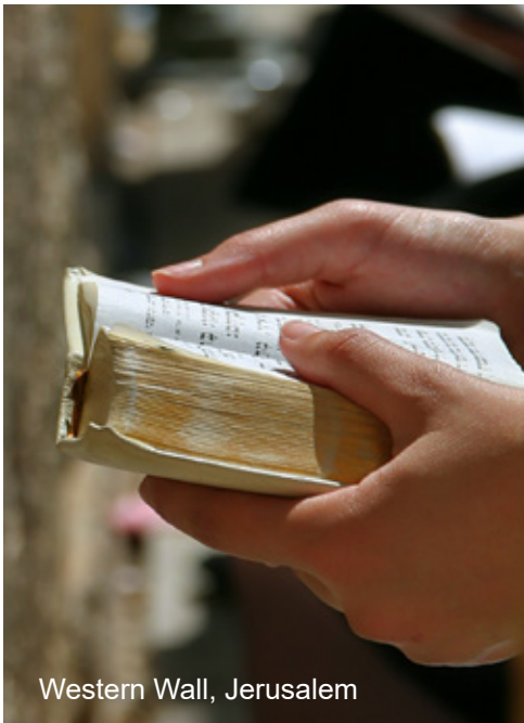
Western Wall, Jerusalem

(Qeser El Yehud) is the Israeli side of Bethany Beyond the Jordan. In this area, Jesus was baptized by John the Baptist, Elijah, and Elisha crossed the Jordan, as well as the children of Israel, led by Joshua, entered the Promised Land. Our lodging for the evening is at the Dead Sea – the lowest place on earth. Spend time in the special spa and enjoy a dip in the Dead Sea for a relaxing float before dinner. B | D