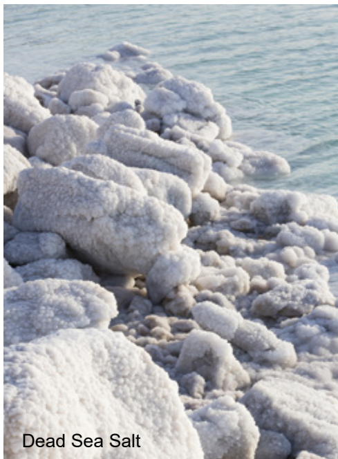
Dead Sea Salt