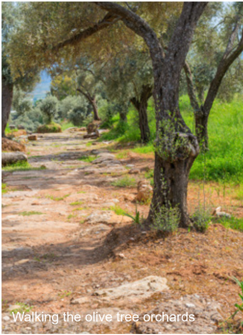
Walking the olive tree orchards