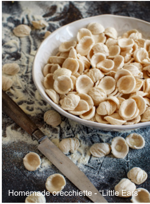
Homemade orecchiette - "Little Ears"