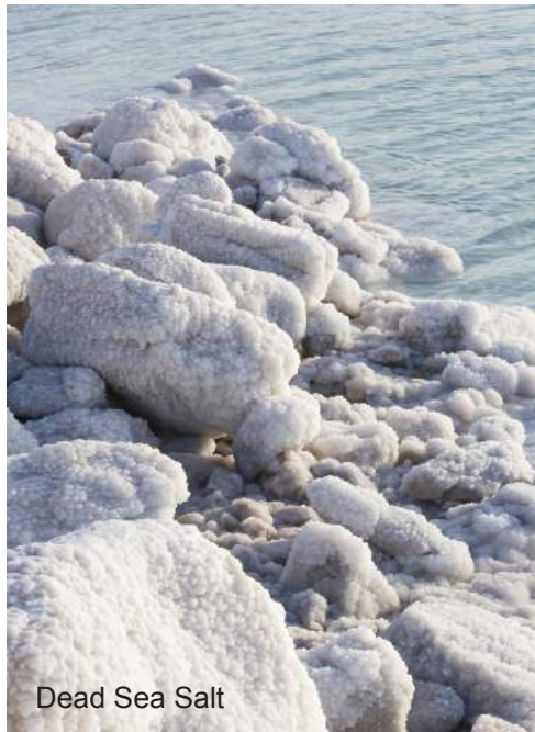
Dead Sea Salt