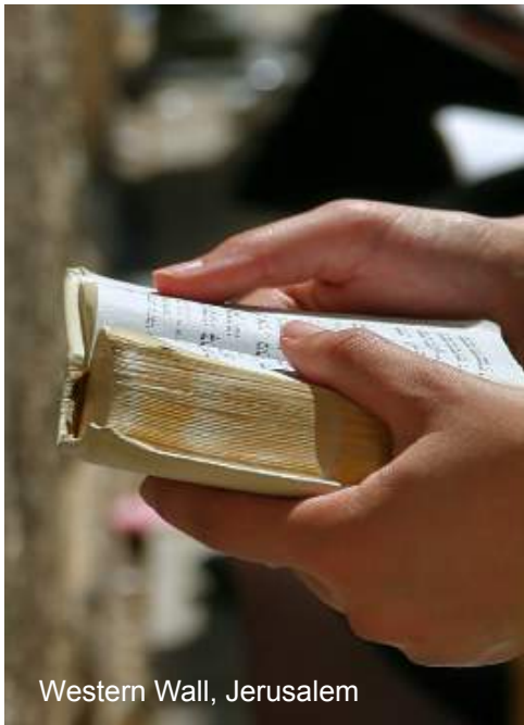
Western Wall, Jerusalem