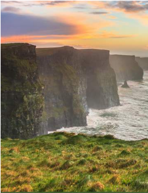
Cliffs of Moher