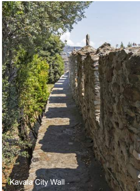
Kavala City Wall