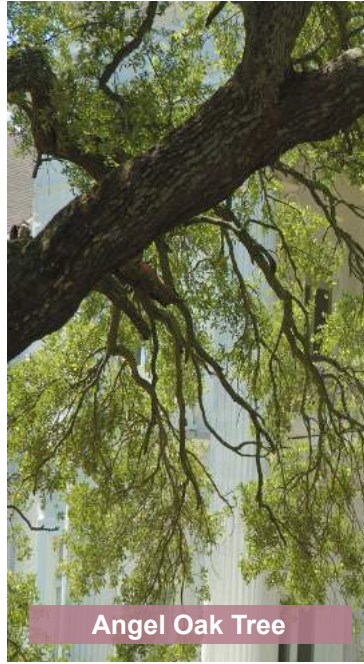
Angel Oak Tree