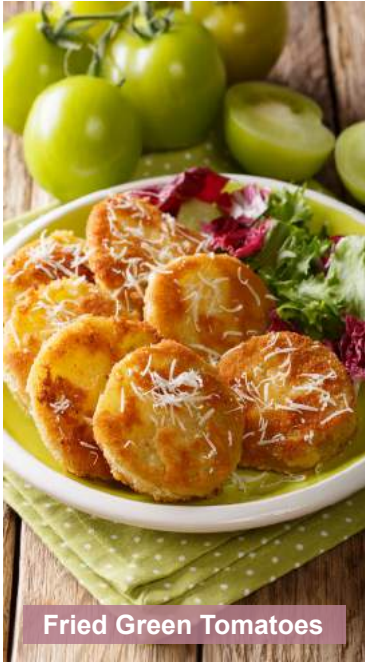
Fried Green Tomatoes