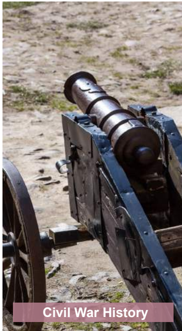
Civil War History