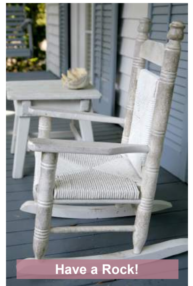
Have a Rock!