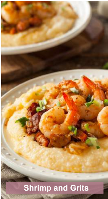
Shrimp and Grits