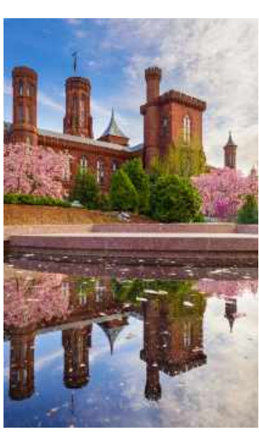
April 10, 2023 - Monday