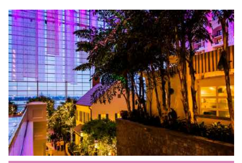
Gaylord National Resort - Lobby Shops