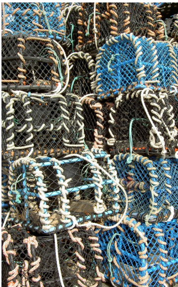
Crab and Lobster Pots

After a filling breakfast, we are off to enjoy a Boston city tour featuring Boston Commons, the Old State House, and Old North Church, where Paul Revere got the signal to start his famous ride, the Old South Meeting House, Beacon Hill, and Old Ironsides. We will visit the Faneuil Hall Marketplace (also called Quincy Market), located in downtown Boston near the waterfront and originally gifted to the city in 1742. This fun place is set around a cobblestone promenade where jugglers, magicians, and musicians entertain passers-by. Shops offering the perfect blend from antiques to the latest fashions. This world-famous Food Colonnade features thirty food merchants representing cuisine from around the globe that will tease your tastebuds. Later we depart Boston and travel to Plymouth. We will Pilgrim's 1627 village, where costumed interpreters visit