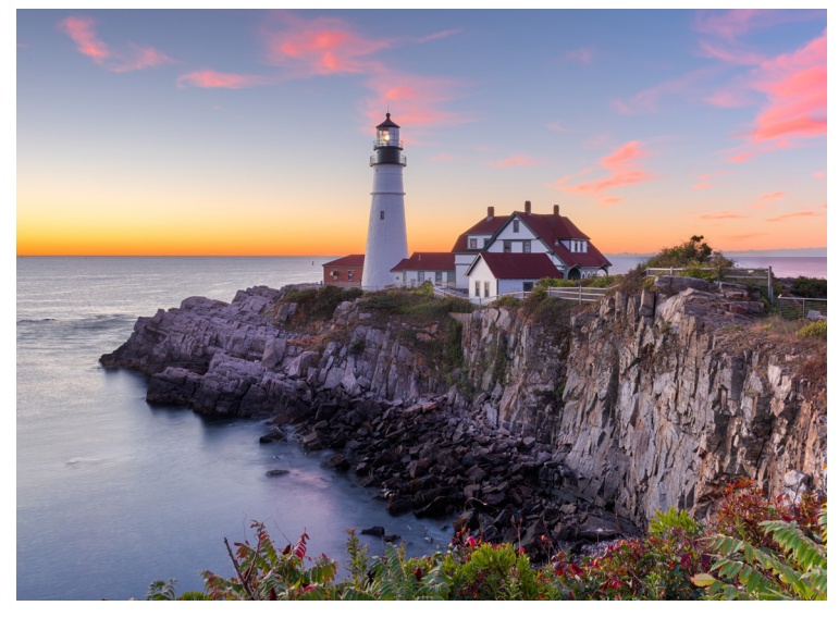
Portland Head Lighthouse

Itinerary subject to change! B = Breakfast D = Dinner