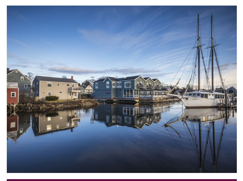
Village Harbor View

Historic Boston – Fenway Park - Ogunquit / Kennebunkport After a filling breakfast, it is time to enjoy a Boston city tour featuring Boston Commons, the Old State House, Old North Church, where Paul Revere got the signal to start his legendary ride, the Old South Meeting House, Beacon Hill, and Old