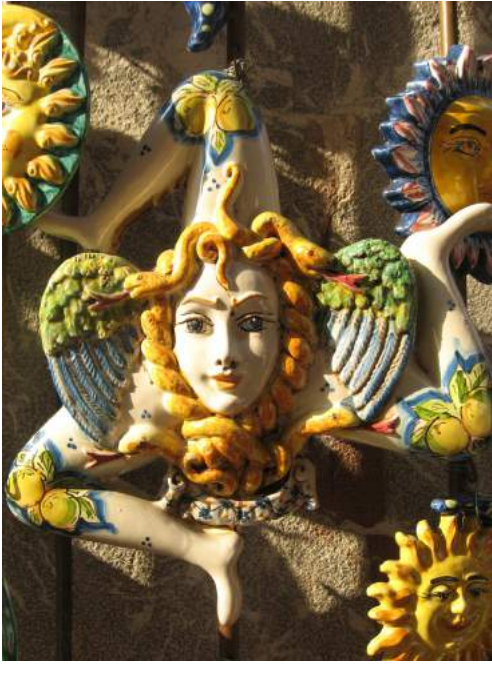
travel inside the Sicilian traditions and history; simply a wonderful way to enjoy the morning hours. The remainder of the day is yours to relax in Taormina. B

After breakfast, it is time to learn about Sicilian art and ceramics. Feel like a true Sicilian artist, be inspired by a glass of Prosecco, and create your unique souvenir to take back home with you. During our small-group masterclass, carefully guided by a professional local artist, you will paint your own ceramic souvenir. Our art teacher will lecture us on traditions and mythologies employed in Sicilian ceramic art over the centuries. Become a real artist in a family-friendly atmosphere, be inspired, and have fun with your fellow travelers. This is the perfect cultural experience to