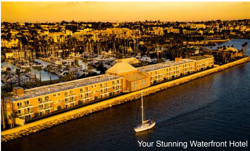
Your Stunning Waterfront Hotel