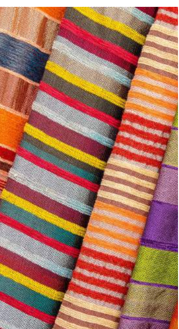
Day 1 - Tuesday - January 21, 2025 Road to California Quilt Show

Start your adventure by arriving at Ontario International Airport early afternoon and settling into the refined accommodations of Embassy Suites by Hilton Ontario Airport. This lovely hotel is conveniently located just over 2 miles from the Quilt show. Enjoy an opening reception at Victoria Gardens followed by a relaxing evening at the hotel. D