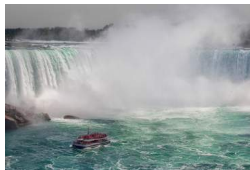
Niagara Falls Boat Tour

The water flows from streams and rivers that empty into the Great Lakes, from Lake Superior down through Niagara to Lake Ontario, then into the St. Lawrence River to the Atlantic Ocean.