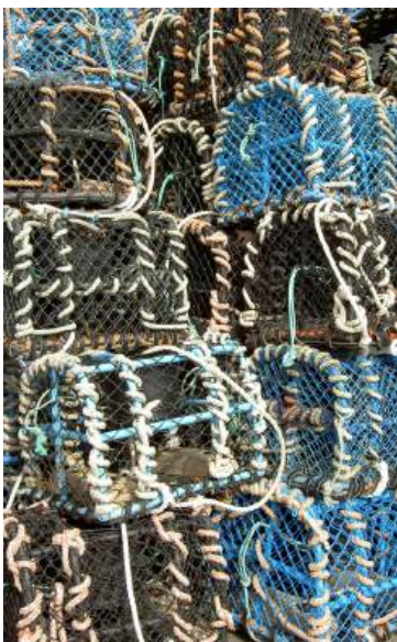
Crab and Lobster Pots

After a filling breakfast, we are off to enjoy a Boston city tour featuring Boston Commons, the Old State House, and Old North Church, where Paul Revere got the signal to start his famous ride, the Old South Meeting House, Beacon Hill, and Old Ironsides. We will visit the Faneuil Hall Marketplace (also called Quincy Market), located in downtown Boston near the waterfront and originally gifted to the city in 1742. This fun place is set around a cobblestone promenade where jugglers, magicians, and musicians entertain passers-by. Shops offering the perfect blend from antiques to the latest fashions. This world-famous Food Colonnade features thirty food merchants representing cuisine from around the globe that will tease your tastebuds. Later we depart Boston and travel to Plymouth. We will Pilgrim's 1627 village, where costumed interpreters visit