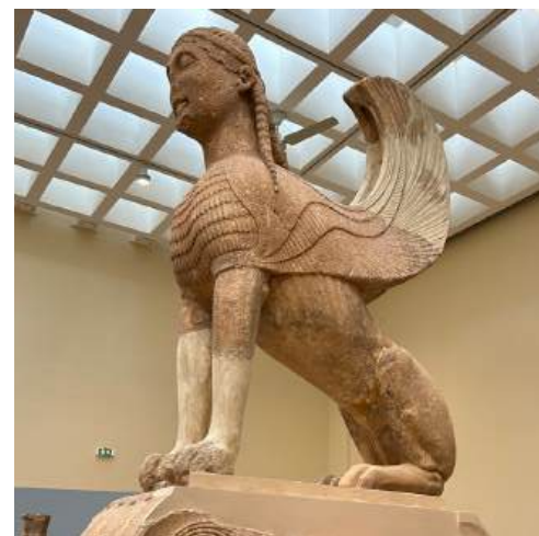
Delphi Sphinx - a Myth or a Fact?

B = Breakfast, L = Lunch, T = Tasting, D = Dinner