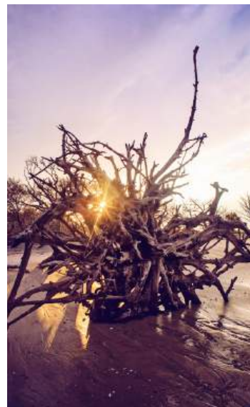
Jekyll Island Driftwood

B = Breakfast L = Lunch D = Dinner C = Cocktail