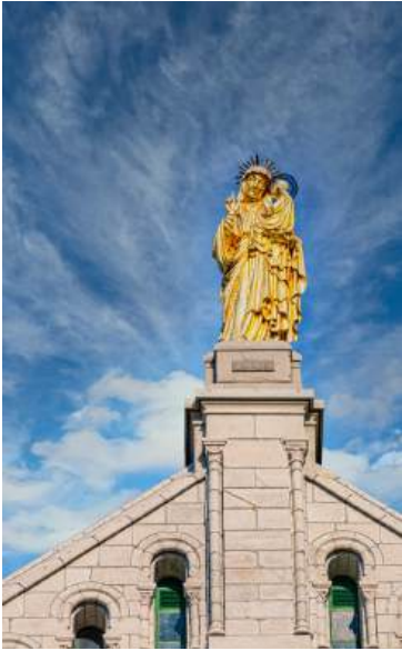
Sainte Anne de Beupre Catholic Church